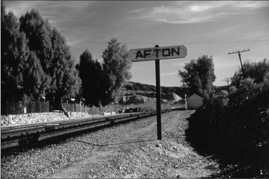
Figure 1. Afton Station, California.