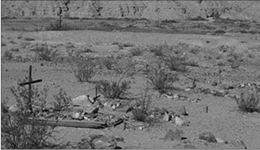
Figure 3. Five unidentified burials in the cemetery.